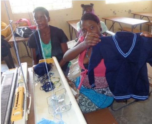
Women learning to make school sweaters using the new knitting machine