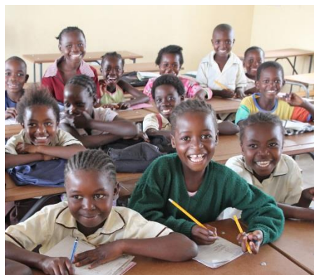
"We love learning!"