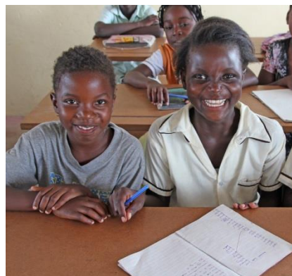
"And we love our new desks!"

The new African Vision of Hope School in Kafue, Zambia has opened its doors and the classrooms are pulsating with children who are anxious to learn to read and write. They are also learning about nutrition, hygiene, how to prevent AIDS and how they are fearfully and wonderfully made. Education is a gift in Zambia, particularly in rural communities like Kafue where schools are too far away to reach by foot or require fees that families cannot pay. Without this gift, their potential to make a difference in their country is lost. These children have stories that are miracles, lives that are changed forever. It all starts with a simple yes! Yes, I will sponsor a child. Yes, I will go. Yes, I will give. God turns our yes's into His story. Help write your story in the African Vision of Hope story book today.