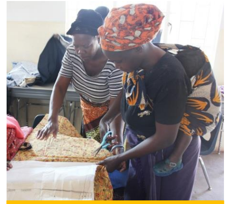
Training with the AVOH sewing team

One of our favorite things about the women’s empowerment programs is seeing the joy and dignity these women experience in being able to provide for their families and develop meaningful relationships with other women. Many of these women are widows and have been neglected, abused and left to do harmful jobs such as trash picking and alcohol brewing. Literacy, health education and skills training provided through AVOH teaches women to develop sustainable businesses and become voices in their communities.