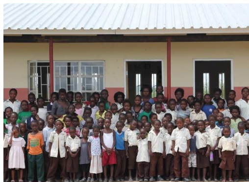
Students stand in front of their new school building in Kafue