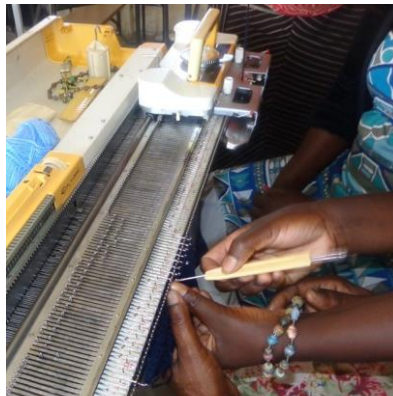
Knitting and bead making