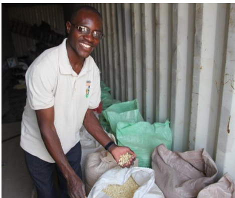
First crop of maize

"[s not this the kind of fasting ] have chosen: to loose the chains of injustice and untie the cords of the yoke, to set the oppressed free and break every yoke?" Isaiah 58:6