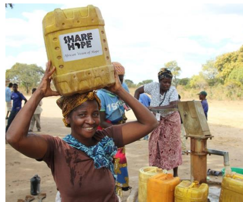
Women getting their water after the well repairs

Help provide clean water and sanitation facilities to the communities in Zambia at africanvisionofhope.org or use the enclosed envelope.