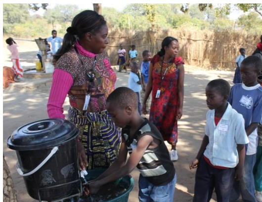
Hand washing station at the AVOH School in Chongwe