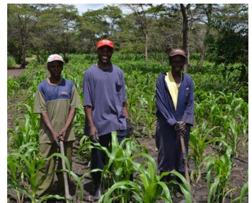
Teaching others to improve their farming skills on the Chikumbi Farm

Help support the African Vision of Hope Farm Project at www.africanvisionofhope.org