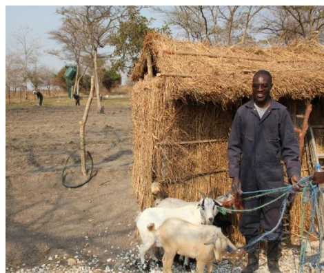
The goats are starting to multiply and will provide meat and milk