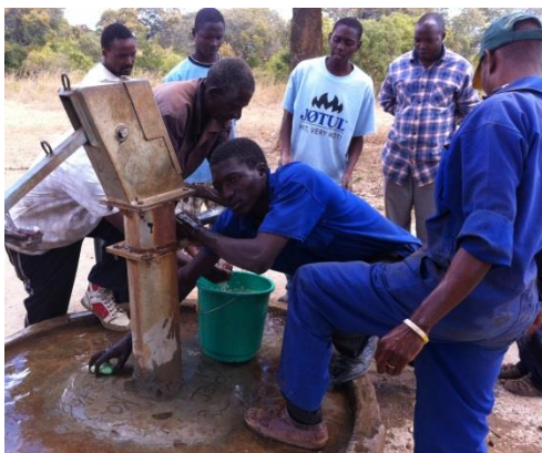
Village men preparing the well

The African Vision of Hope Christian School in Chongwe has something that everyone in the village needs: the well! When it breaks down, like it did last week, everything changes for everyone. The 15 minute stretch to get water suddenly takes over an hour each way. What does this village do? The village men, trained in well repair, come together and work as a team. Within hours the water is flowing and the race to the watering station is once again under way. Providing sanitation along with clean water and hygiene training is foundational to community development. All three are equally needed! Most villages do not have access to toilets. Each African Vision of Hope School will meet the challenge of providing basic sanitation by 2014, providing more than 1500 children and thousands of families with the combination of clean water, hygiene training and sanitation facilities. Together they fight poverty, hunger, child deaths and provide dignity for those we serve.