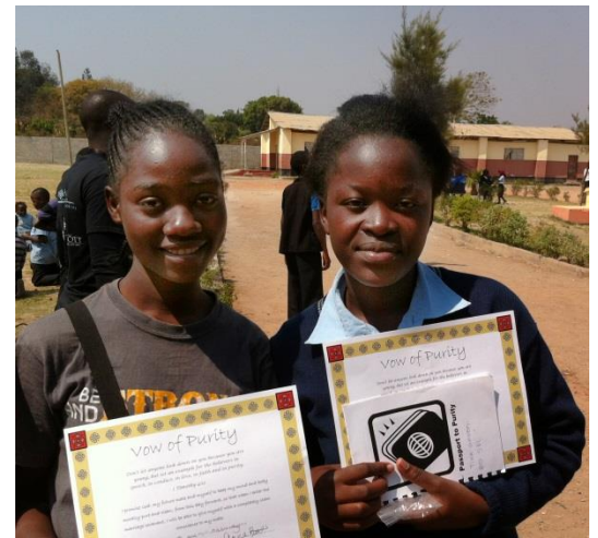
Two of the students at Kabulonga who have completed the Passport to Purity program

African Vision of Hope is committed to the next generation of leaders in Africa. We are initiating a curriculum aimed at HIV/AIDS education and purity for the AVOH schools. The curriculum, written by teachers in the US, will target youth in Africa. If behavior is to be changed, young people must be a priority. These youth offer their nation a "window of Hope" and they are eager to learn. The HIV prevalence rate in Lusaka, Zambia is still over 20% with women and girls at the forefront as they suffer inequality and abuse. The impact on the economy and families is devastating as thousands of children are left behind to beg, steal and prostitute to survive.