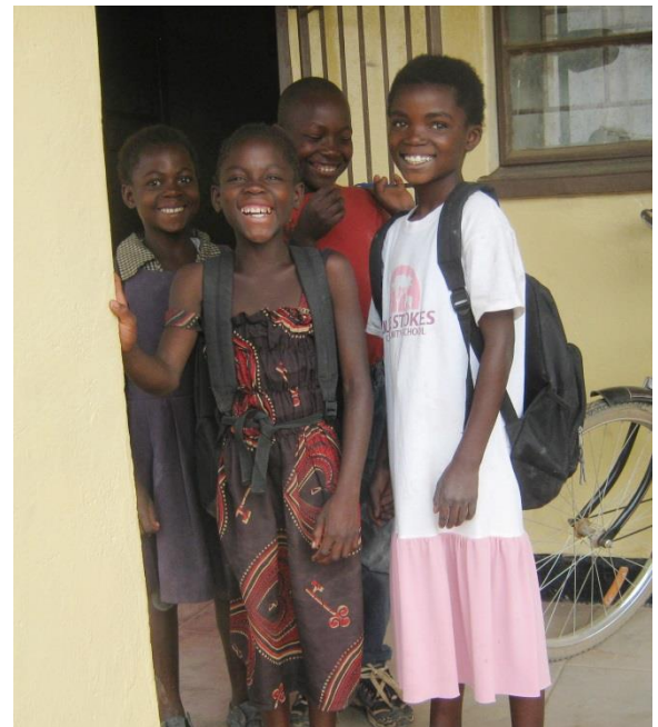
The African Vision of Hope School in Kasama, Zambia has 261 children in grades 1-4.

To help bring education to the communities in Zambia, visit africanvisionofhope.org , call our office at 618-288-7695 or use the enclosed envelope.