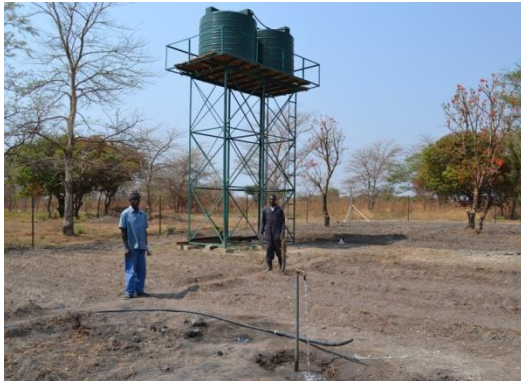
Water tanks on the AVOH farm that will bring irrigation during the dry season