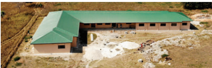
The 10,000 square foot Girls House of Hope under construction