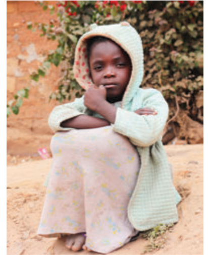
Above: Instead of sitting in classrooms, children are being sold into marriage or child labor, watching their futures fade out of reach like this little girl.

Rescue and redemption is not only possible, it is happening. It is because of YOU.